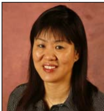
"Jenny" Lang Ping Head Coach