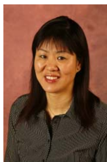
“Jenny” Lang Ping Head Coach USA Women’s National Team Third Year (59-36)

“Jenny” Lang Ping of China, one of the most famous and respected individuals in the history of volleyball, begins her third year leading the U.S. women’s national team.