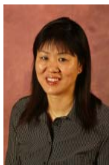
“Jenny” Lang Ping Head Coach USA Women’s National Team Fourth Year (68-38)

“Jenny” Lang Ping of China, one of the most famous and respected individuals in the history of volleyball, begins her fourth year leading the U.S. women’s national team.