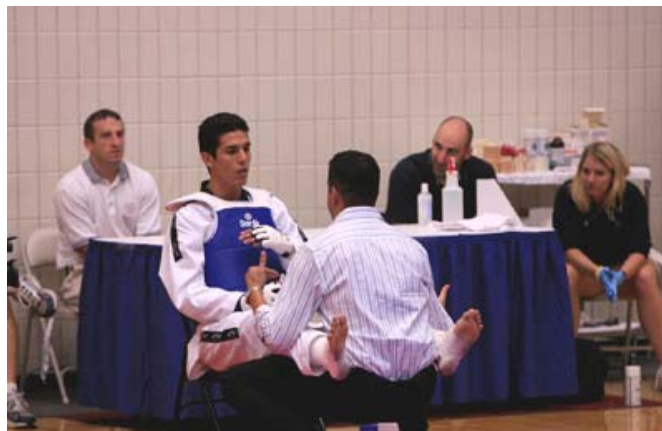
Steven Lopez being coached by his brother Jean Lopez at the 2008 U.S. Olympic Team Trials.

A common thought among coaches in the sport of Taekwondo is that they are “masters” or “instructors” when they sit in the coaching chair. With this mentality, they will often put their own egos first and believe that if an athlete doesn't follow directions or loses that it is a direct reflection on them. To the untrained coach this seems to be the situation, but educated coaches understand that at the end of the day it is about what the athlete learned, gained or experienced. Normally the mentality is to demand that the athlete “respect” the “coach”. With this mentality, coaches put themselves first. As a coach, it is crucial to focus on how the athlete perceives the process. It is important that the athlete believes the coach is focused on developing a better athlete.